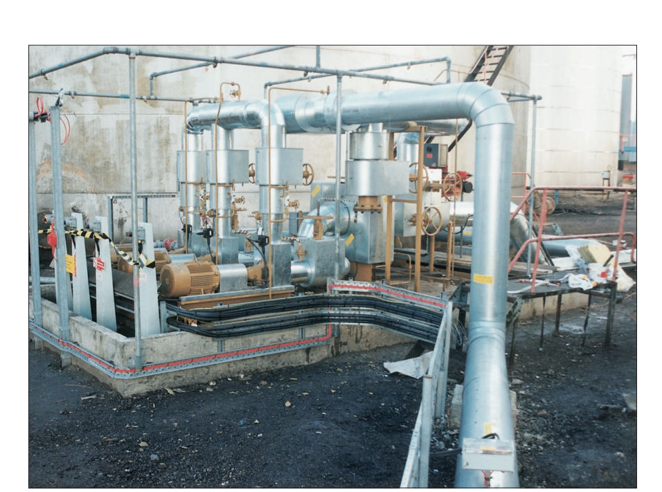
Trace Heating and Insulation of Process Pipework and Pumps