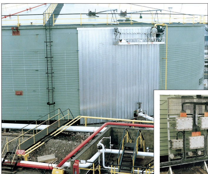
Low temperature Trace Heating of Bulk Storage Tank